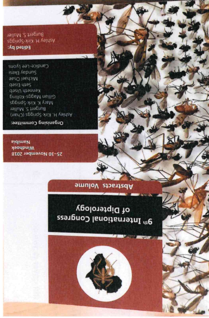
Fig. 2. Front Cover (for illustration purposes).