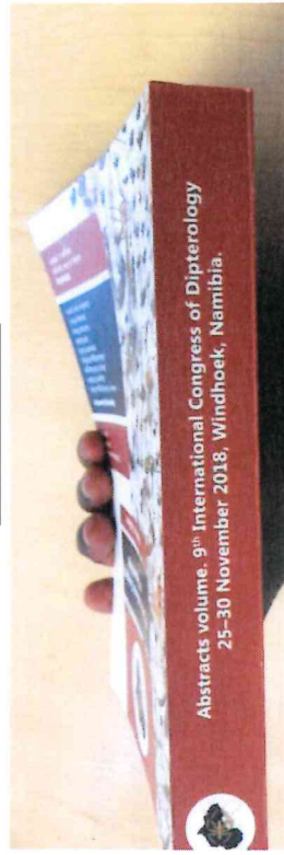
Fig. 1. Book Spine (for illustration purposes).